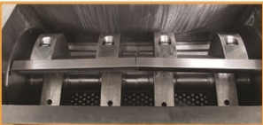
▶ AMG-600P Blades