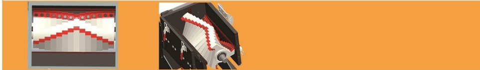
▶ AMG-L Claw Blades