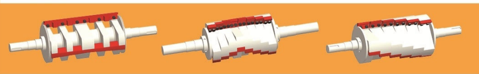
▶ V Type Paddle Blades