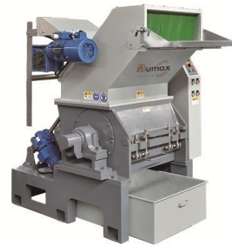
▶ AMG-600G with Auto Feeding System