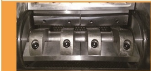
▶ V Type Paddle Blades