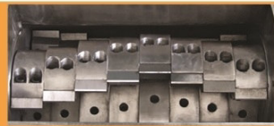
▶ C Type Claw Blades